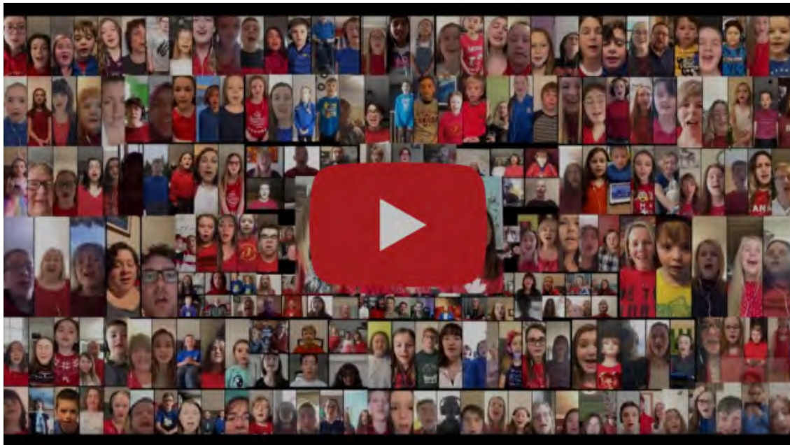
"O Canada" Sung by the Virtual Choir of Newfound and Labrador English School District

If you missed the meeting, you can view the video here by clicking on the image below. You may need to adjust the sound volume. Note: some YouTube videos are preceded and followed by ads. We skip the ads at club meetings.