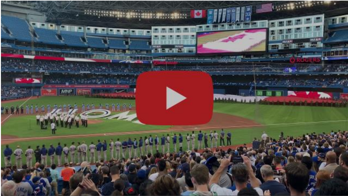
"O Canada" The Toronto Blue Jays Home Opener July 30, 2021